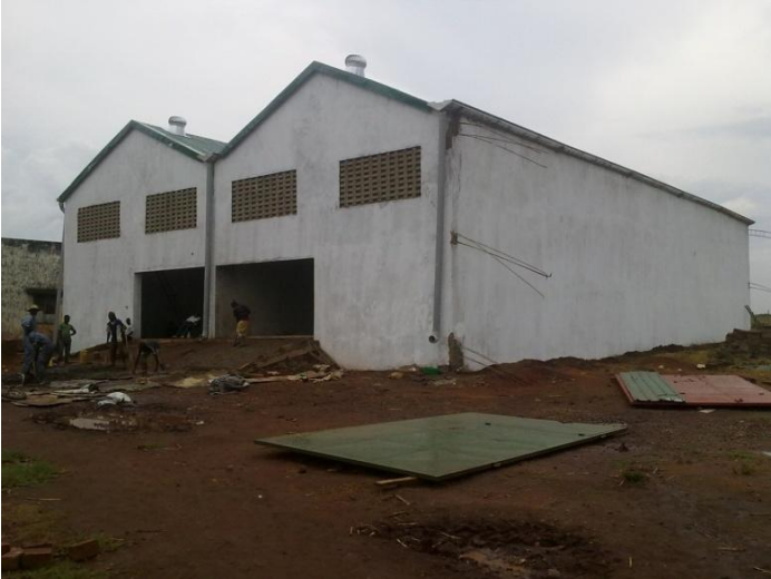
Warehouse Under construction-Silver Oak Investments