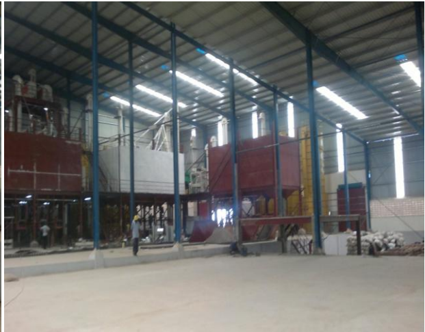
Warehouse constructed-Export Trading Company (U) Ltd