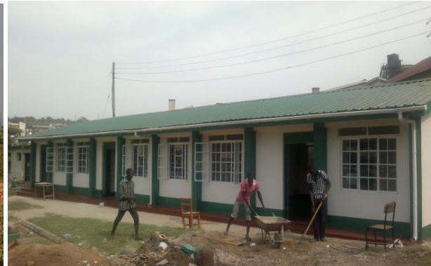
Warehouse construction-Export Trading Company (U) Ltd & Refurbished Class Room Block-Agakhan Education Services