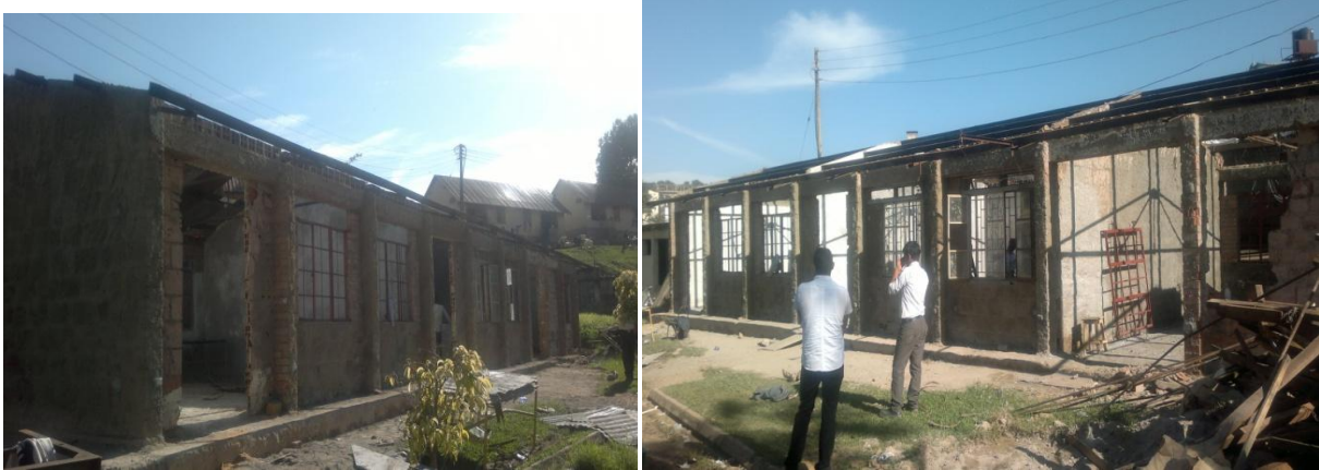
Class Room Block under Refurbishment-Agakhan Education Services