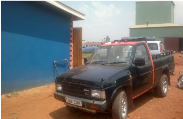
Scaffolding and company Pickup truck