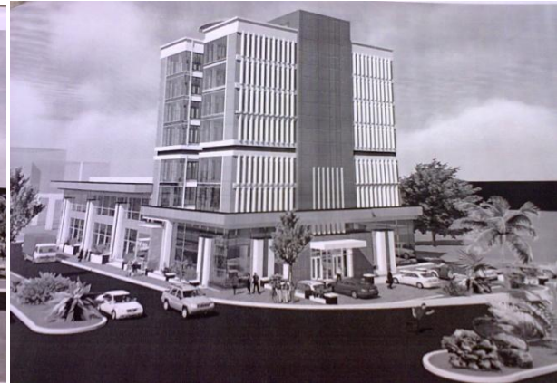
Offices at Jinja Rd-Meera Investments Td