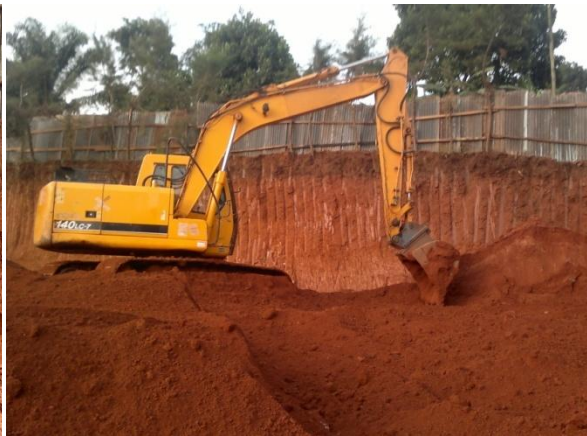
Grader and Excavator on site