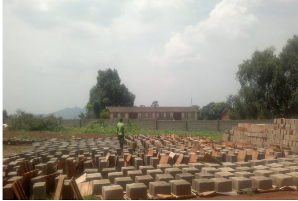
Concrete Block making machine and Blocks produced for the ongoing projects