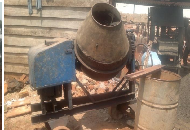
Excavator machine and concrete mixer