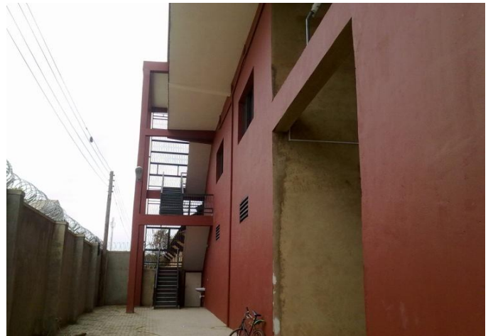
Construction site –sleeping baby factory, industrial Area