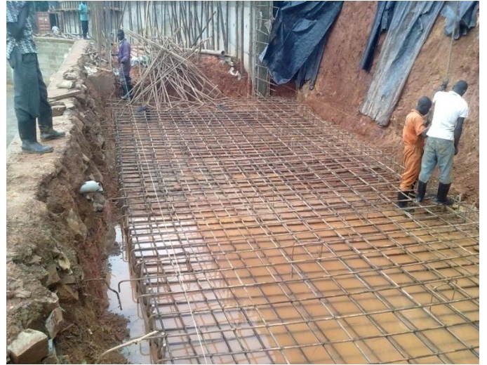
Casting of RCC Retaining Wall and Foundation Steel Works