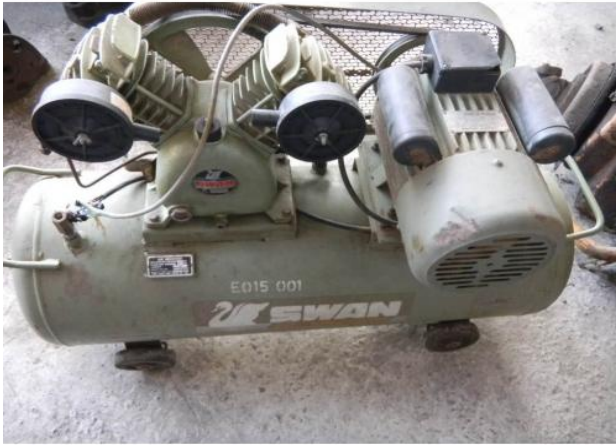
Paint Spray machine