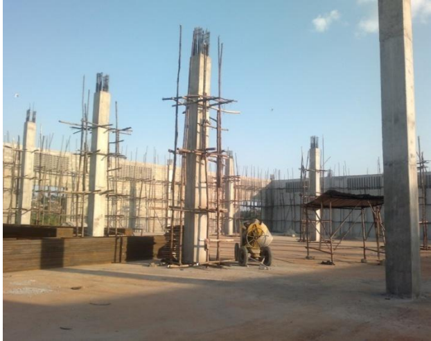
Ware house under construction, Banda site-Meera Investments Ltd