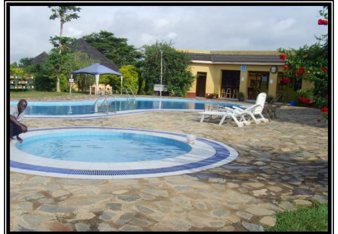
Swimming Pool Tiles and Stone Pitching