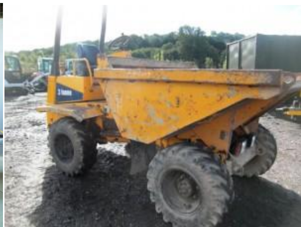
Compressor machine and Dumper