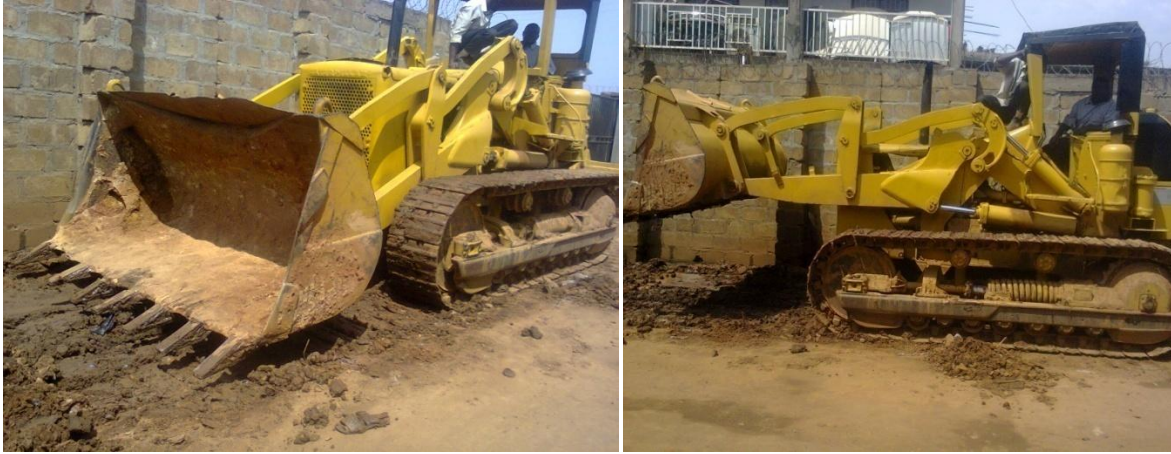
Track Loader machine on site