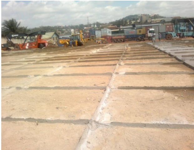
Ware house under construction, Banda site-Meera Investments Ltd & Parking Area under construction, Nakawa Industrial Area-Sunbury Investments Ltd