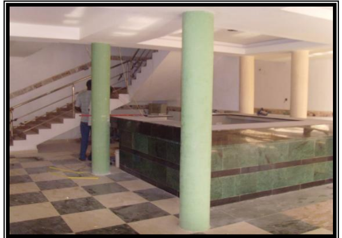
Marble counter Tops, Tiles and Paint work