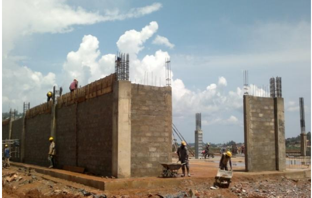
Ware house under construction, Banda site-Meera Investments Ltd