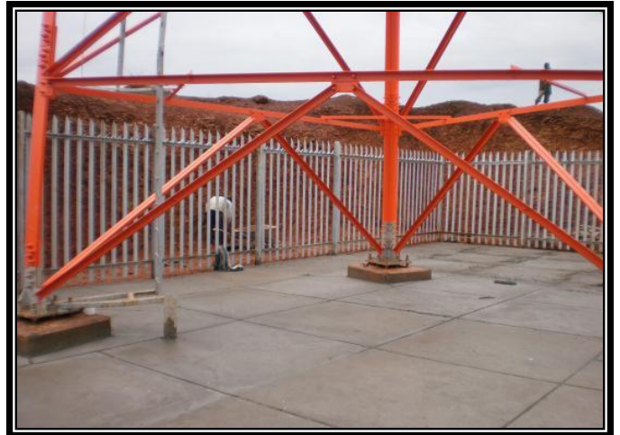
MTN Telecom Tower under Construction