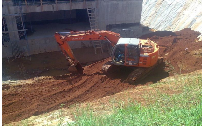
Excavation of Foundations and Backfilling Stage-Kingdom Kampala Ltd