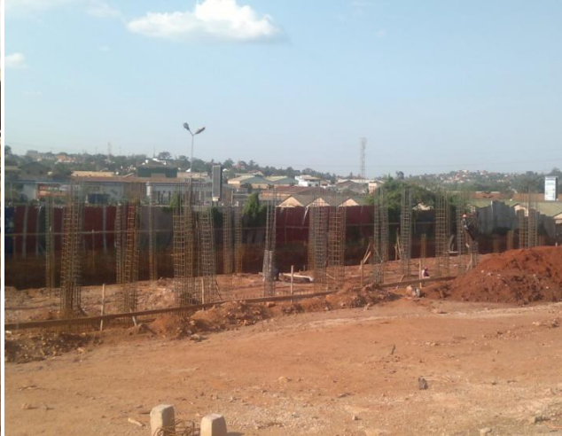
Parking Area under construction & Ware house construction, Nakawa Industrial Area -Sunbury Investments Ltd