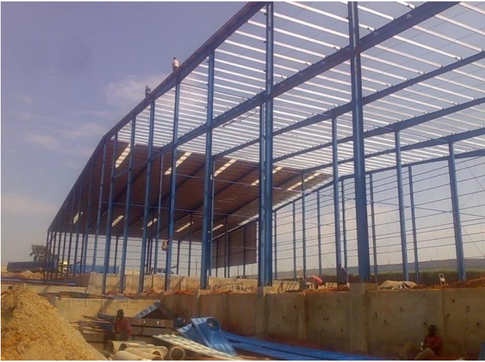
Excavation and Erection of Warehouses