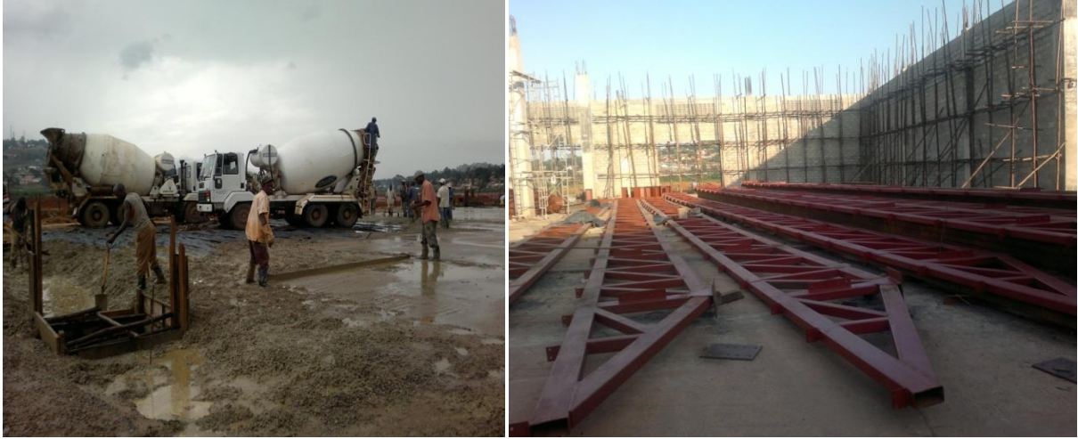
Ware house under construction, Banda site-Meera Investments Ltd