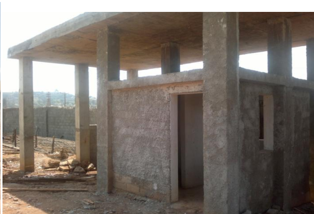
Gate house & Boundary Wall under construction, Bukoto- Meera Investments Ltd