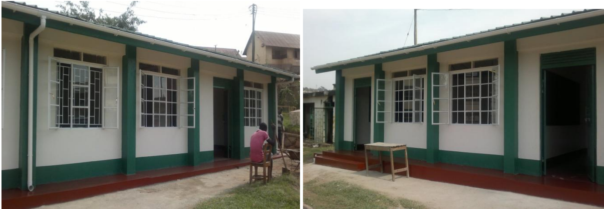
Refurbished Class room Block –Agakhan Education services