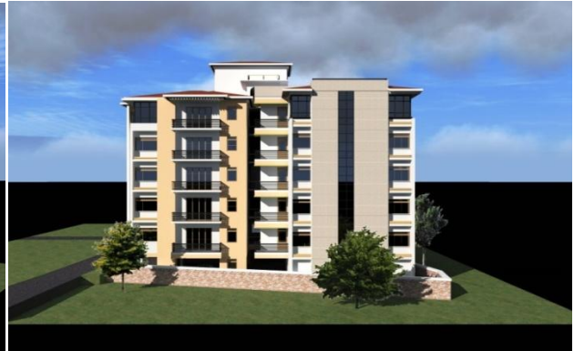
Residential Apartments-Trio Investments Ltd