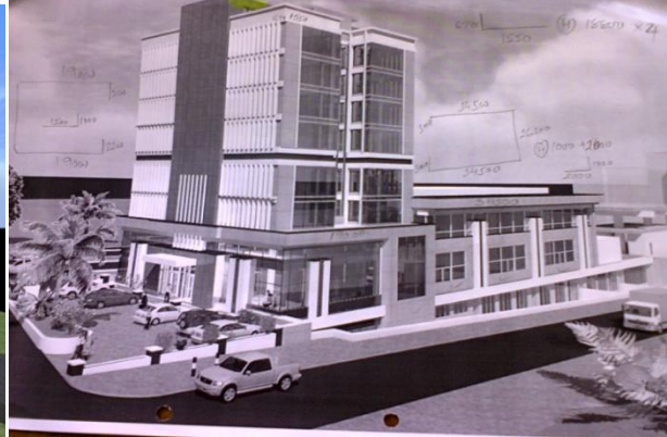
Residential Apartments-Trio Investmt. Offices at Jinja Rd-Meera Investments Td