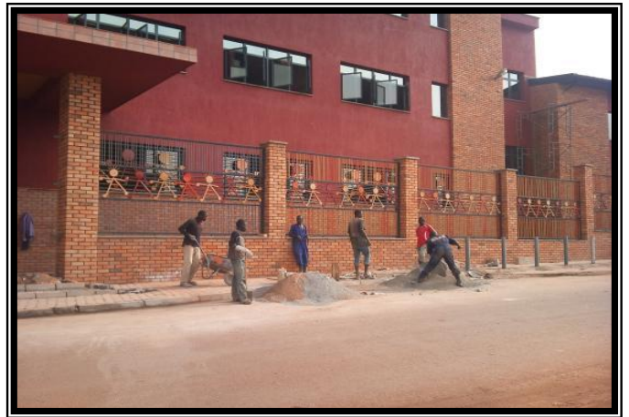
Entrance Gate, Fence and Walk Way- Kampala Parents School