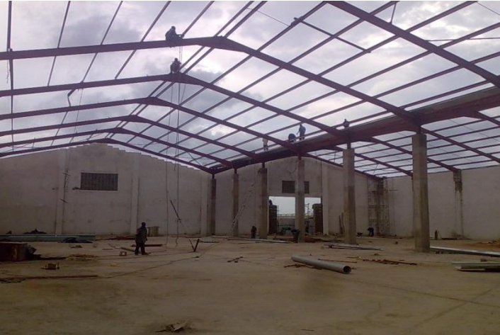
Erection of steel Trusses and roofing-Meera Investments Ltd