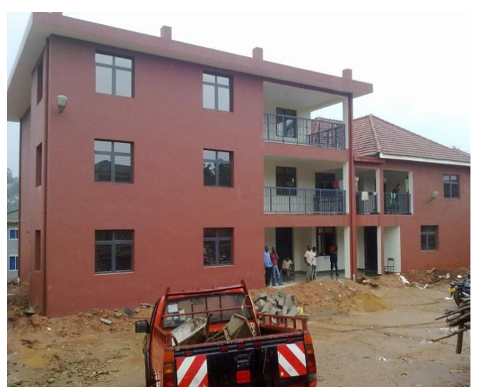
Staff Quarters under construction-Kampala Parents School