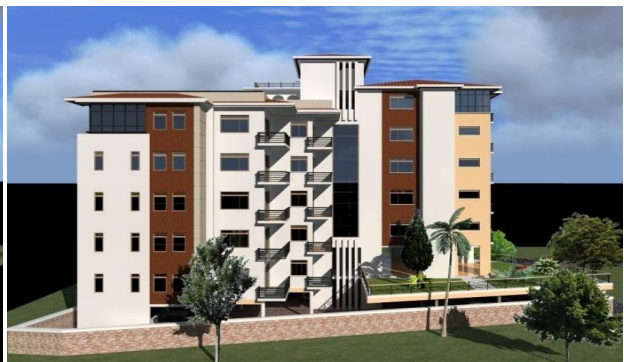
Residential Apartments –Trio Investments Ltd